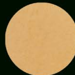
Art. 519 B