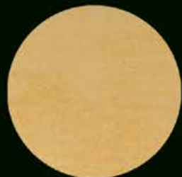
Art. 516 B