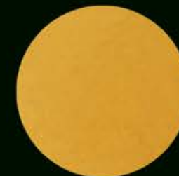
Art. 525 B