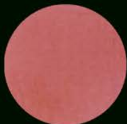
Art. 517 B