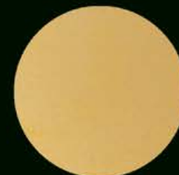
Art. 520 B