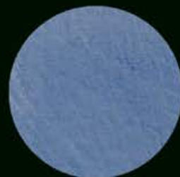
Art. 513 B