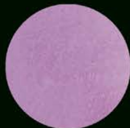
Art. 522 B