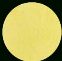
Art. 521 B