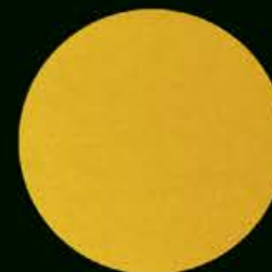
Art. 514 B