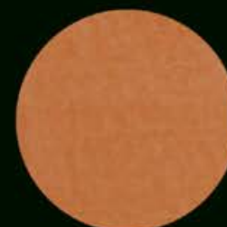
Art. 524 B