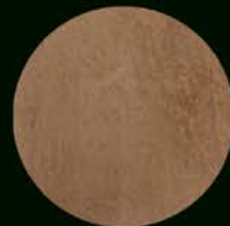
Art. 523 B