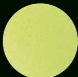
Art. 527 B