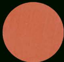
Art. 511 B

I colori di questo catalogo sono indicativi, poiché riprodotti tipograficamente; per garantire una più affidabile resa cromatica è indispensabile l'uso del catalogo real Effect. The colours reproduced in this catalogue may differ slightly from their originals; for more faithful colour reproduction, use a real Effect catalogue.