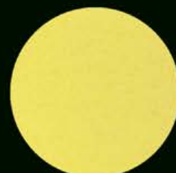
Art. 528 B SPIVER CHANNEL