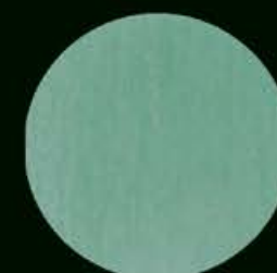
Art. 515 B