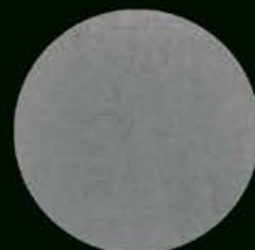
Art. 518 B