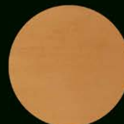
Art. 529 B