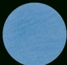
Art. 526 B