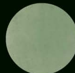
Art. 530 B